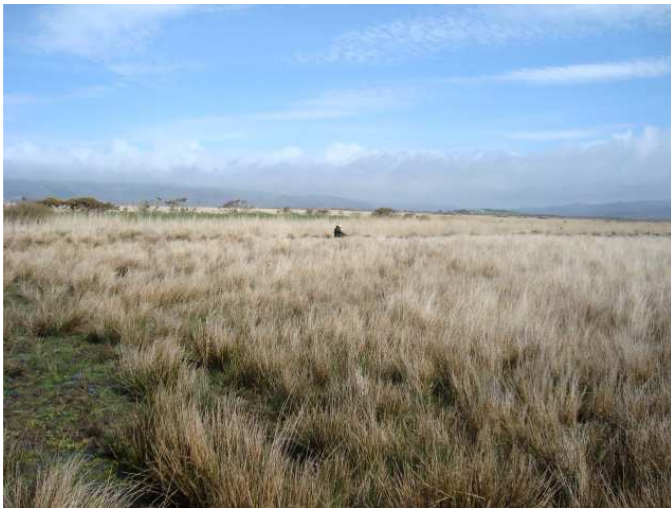
Figure 3: Sieving litter at Morfa Borth on Cors Fochno, April 2014.

A total of 94 other spider species was also found during the 2013 and 2014 surveys (see Table 2 and Appendix 1). Eleven of these are thought to be recorded from Dyfi NNR for the first time, including seven from Ynyslas Dunes and four from Morfa Borth, Cors Fochno. Two Nationally Rare and two Nationally Scarce spiders were found. Species associated with sand dunes included: Ceratinopsis romana ; Mecopisthes peusi , a single female of which was collected on 3 rd October 2013 from the northern end of the dune system (Appendix 1); and Philodromus fallax , a single female was collected in the late afternoon on 9 th April 2014, at the top of a yellow dune ridge to the west side of the site near the elevated boardwalk (Appendix 1).