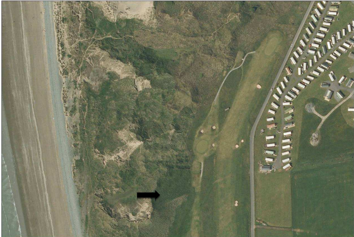
Figure 5: Close-up of location of the October 2014 record of Agroeca dentigera .