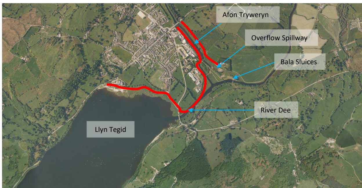
Figure 1 – Location of reservoir embankments and features.

A study area for collection of most environmental data was set at 2km from the outer geographical extent of the embankments for statutory designated sites and at 1km for other data.