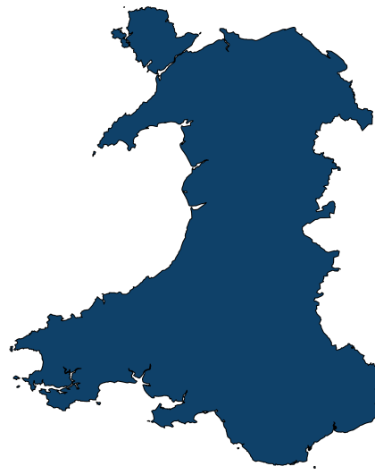
Figure 1: Wales distribution and range map for S5009 - Soprano pipistrelle ( Pipistrellus pygmaeus ). Coastline boundary derived from the Oil and Gas Authority's OGA and Lloyd's Register SNS Regional Geological Maps (Open Source). Open Government Licence v3 (OGL). Contains data © 2017 Oil and Gas Authority. The 10km grid square distribution map is based on available species records within the current reporting period.